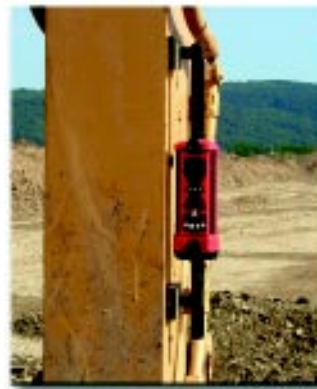
Optional Magnetic Mount